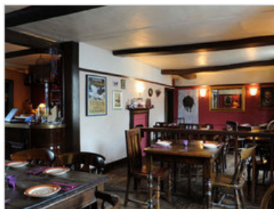
Casa Ruiz in Bridgnorth, Shropshire, was founded on just £6k by the Yufera-Ruiz's

Fitting out and running a boutique hotel will inevitably cost more than opening a 30-cover neighbourhood restaurant, but in most cases business owners will need to raise a five, if not six figure sum before setting up or opening that next site.